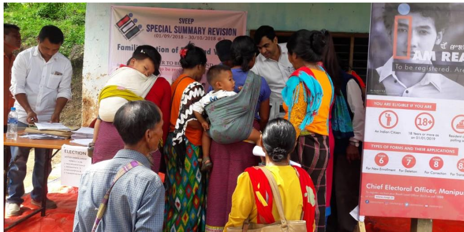
Photo of DEO and Election Staffs interacting with participants