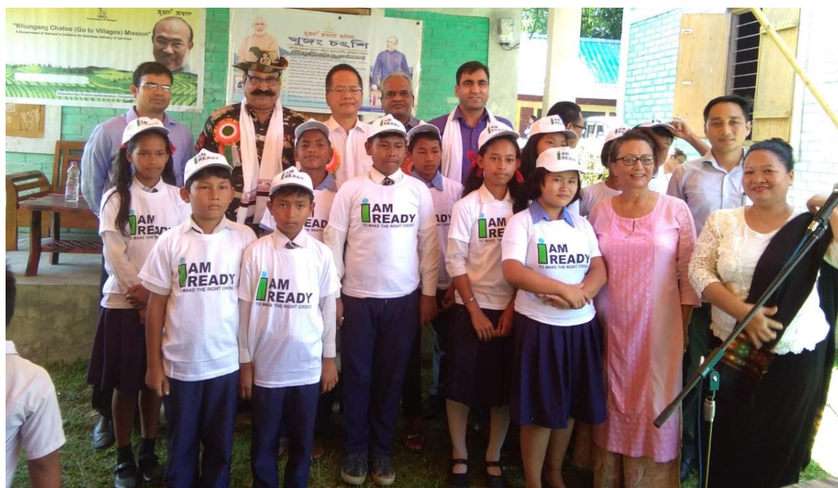
Facilitation of Future Voters by DEO,CCP, OSD (Election) and AERO/Henglep (Guest: DEO,Bishnupur)