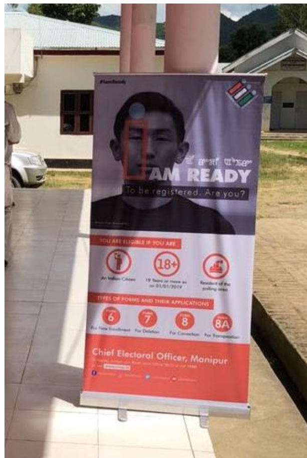
SVEEP/SSR Banner at the entrance