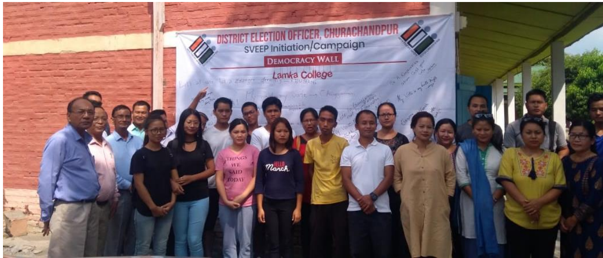
Democracy Wall at Lamka College