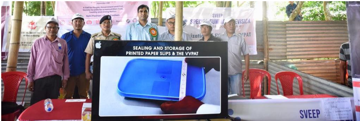
Familiarization of EVM and VVPAT