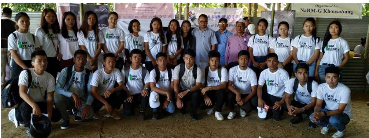
Volunteer during Campaign