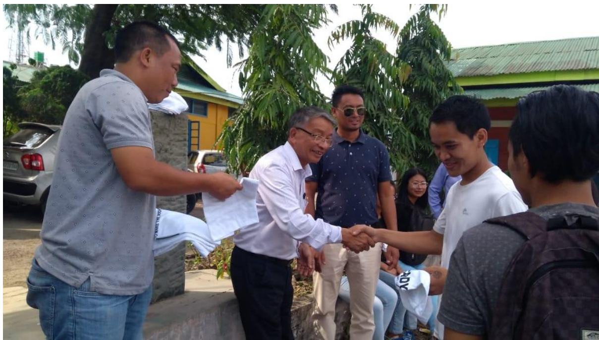
Distribution of SVEEP T-Shirt and Caps to winners of spot quiz