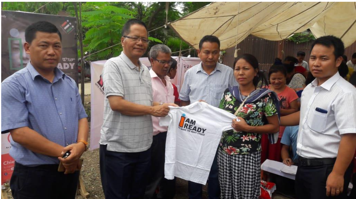
Distribution of SVEEP T-Shirt