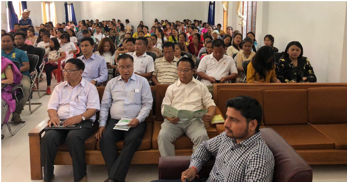
Participants at the program