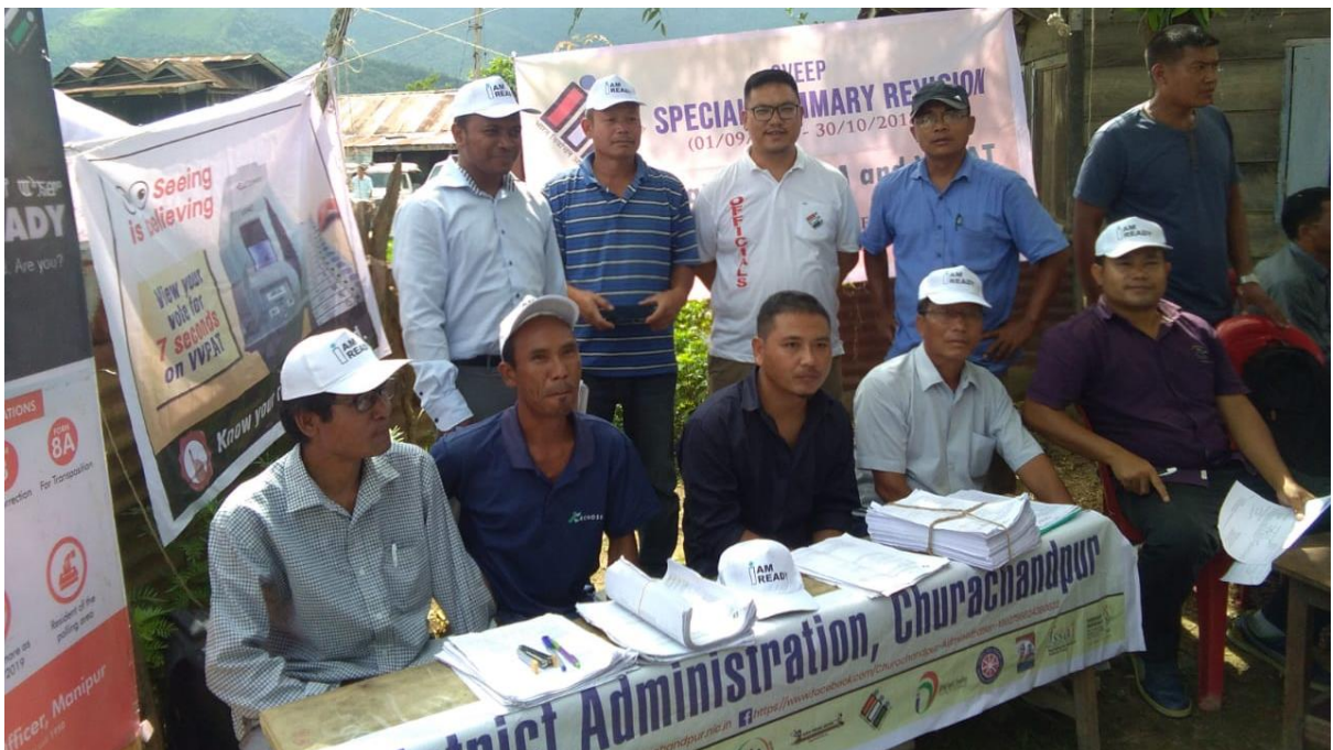
AERO, Election Staff and BLOs at SVEEP campaign