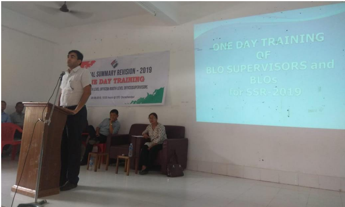
DEO Addressing the Participants