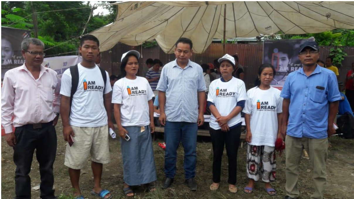
OSD (Election) with Election Staff during SVEEP Campaign