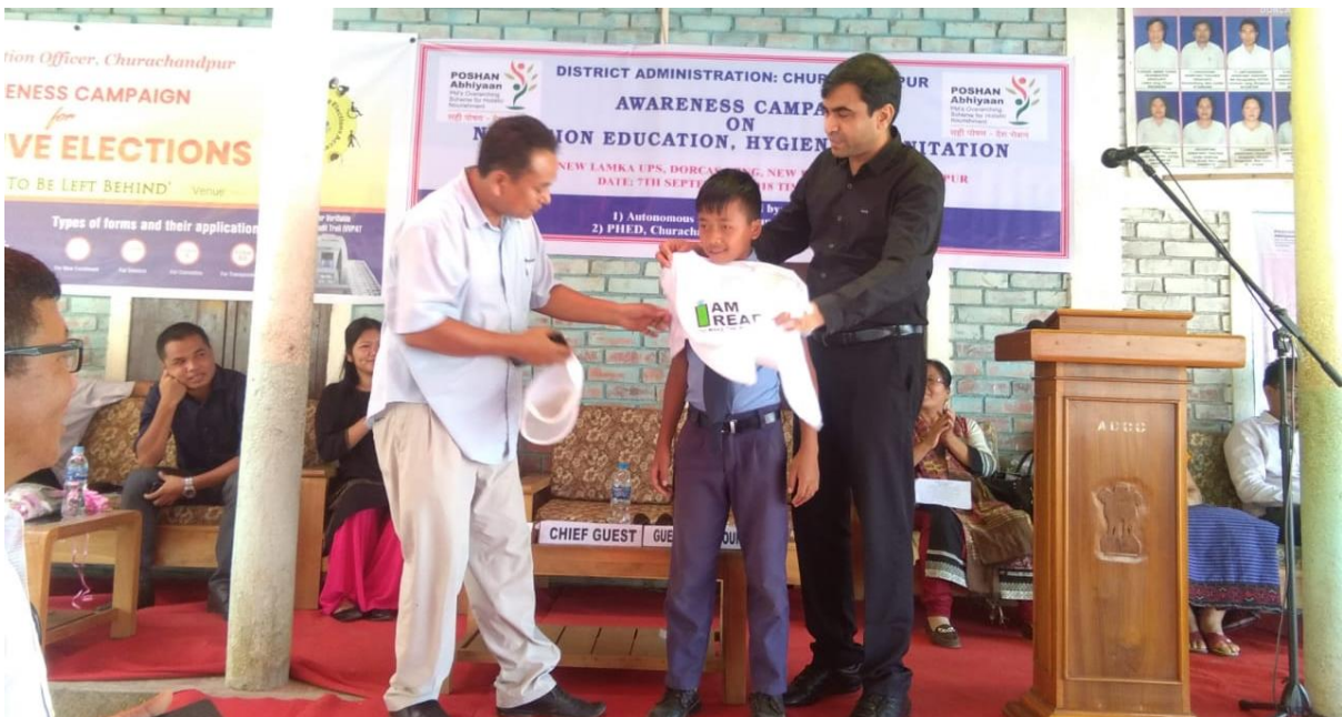
DEO distributing SVEEP T-Shirt