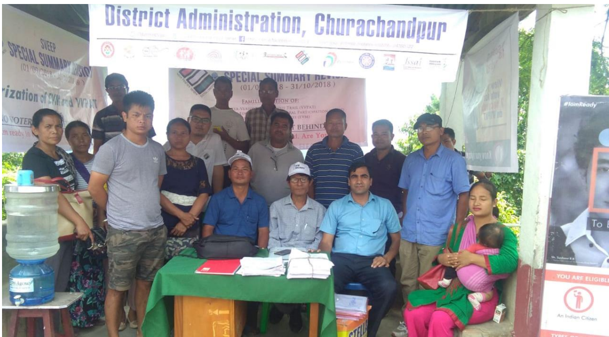
SVEEP Campaign at Singhat