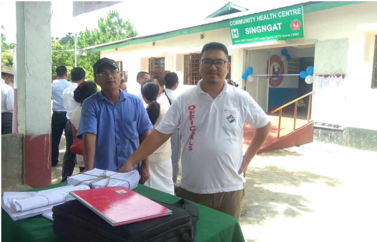
SVEEP Campaign at Singhat