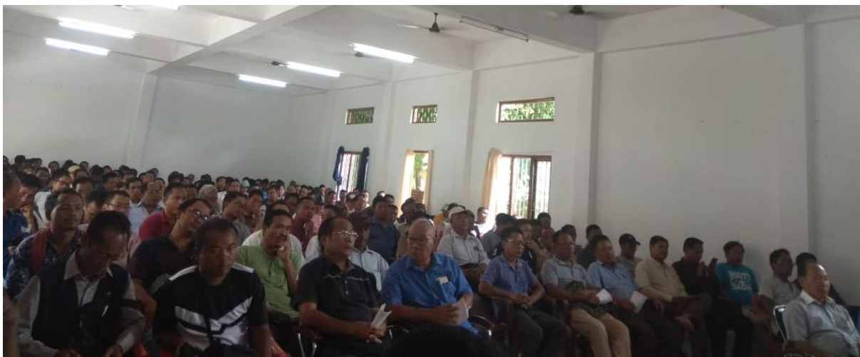
Photo of Participants