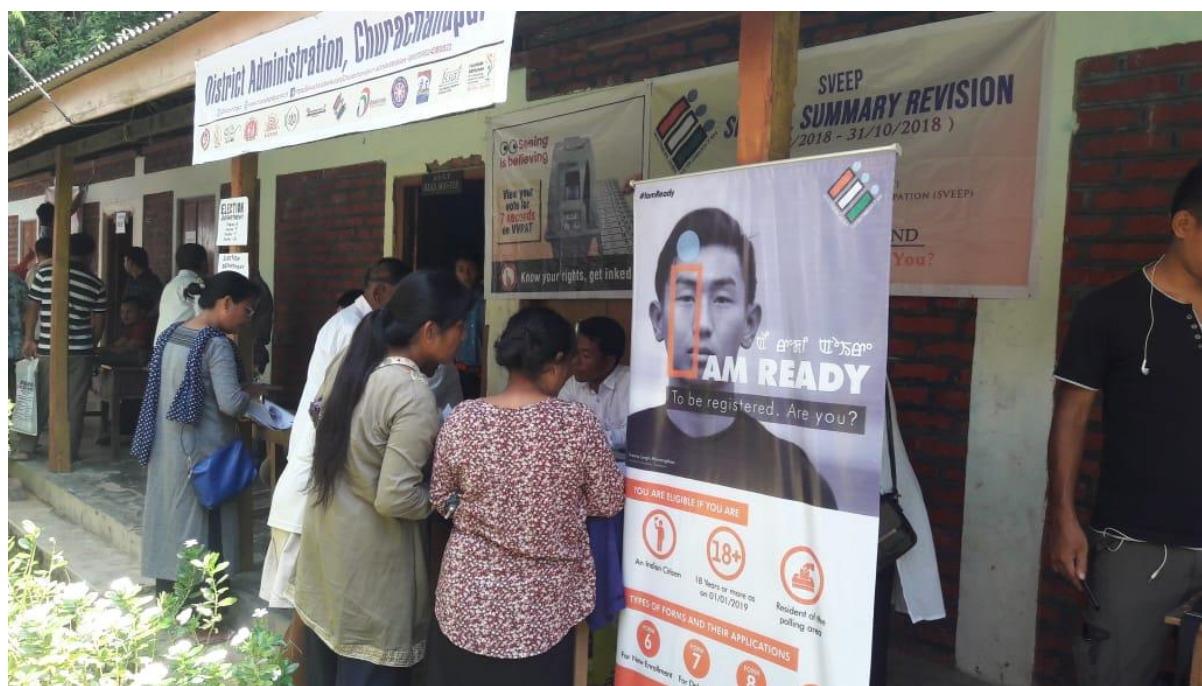
BLO and Election Staffs interacting with Participants