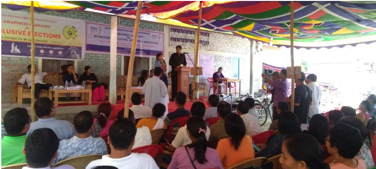
DEO interacting with Students/Participants