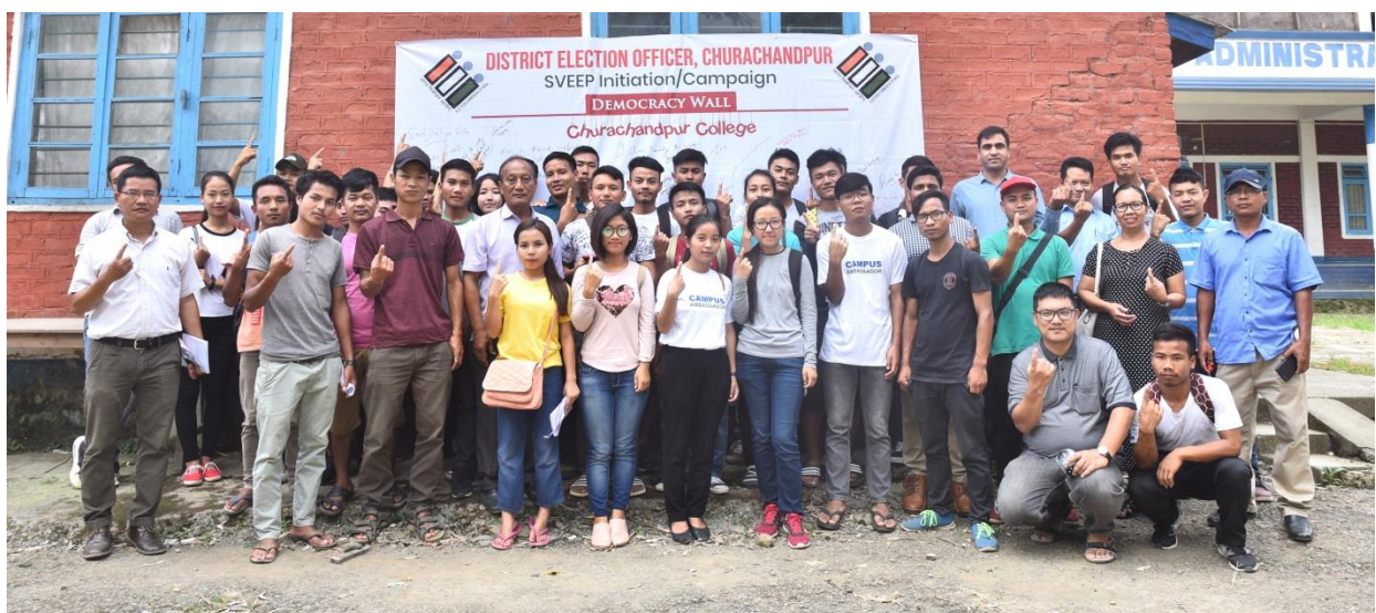
Democracy Wall at Churachandpur College