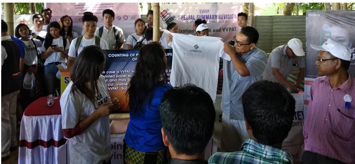
Distribution of SVEEP T-Shirt