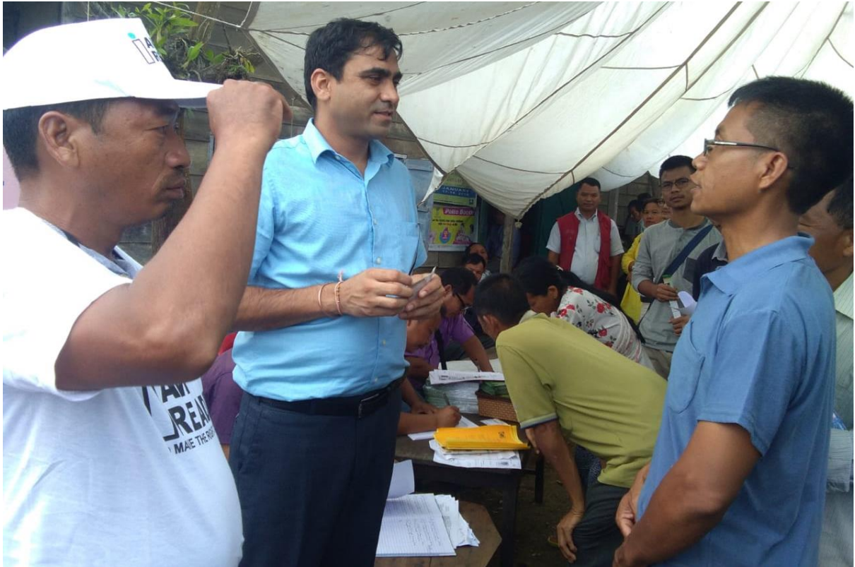
DEO interacting with participants